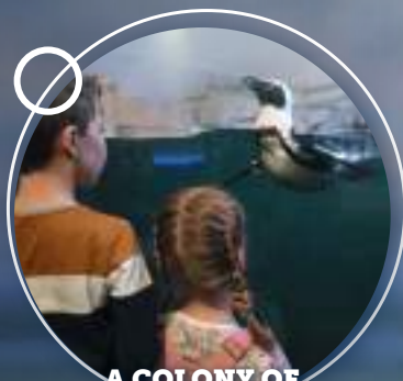
A COLONY OF TWENTY OR SO PENGUINS