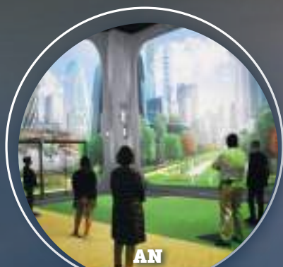
AN IMMERSIVE 430 SQ.M ROOM FLOOR-TO-CEILING SCREENS

Hurricanes, melting ice-caps, rising sea levels... Prepare to go on a spectacular voyage through the heart of the effects of global warming that will take you on a journey of discovery to meet our colony of African penguins and their immersive 430 sq.m of exhibition space with floor-to-ceiling screens. As you leave this immersive exhibition, see that solutions do exist for preserving the environment and living in a more ecological way!