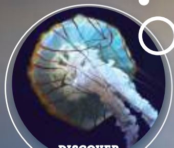
DISCOVER MARINE ECOSYSTEMS